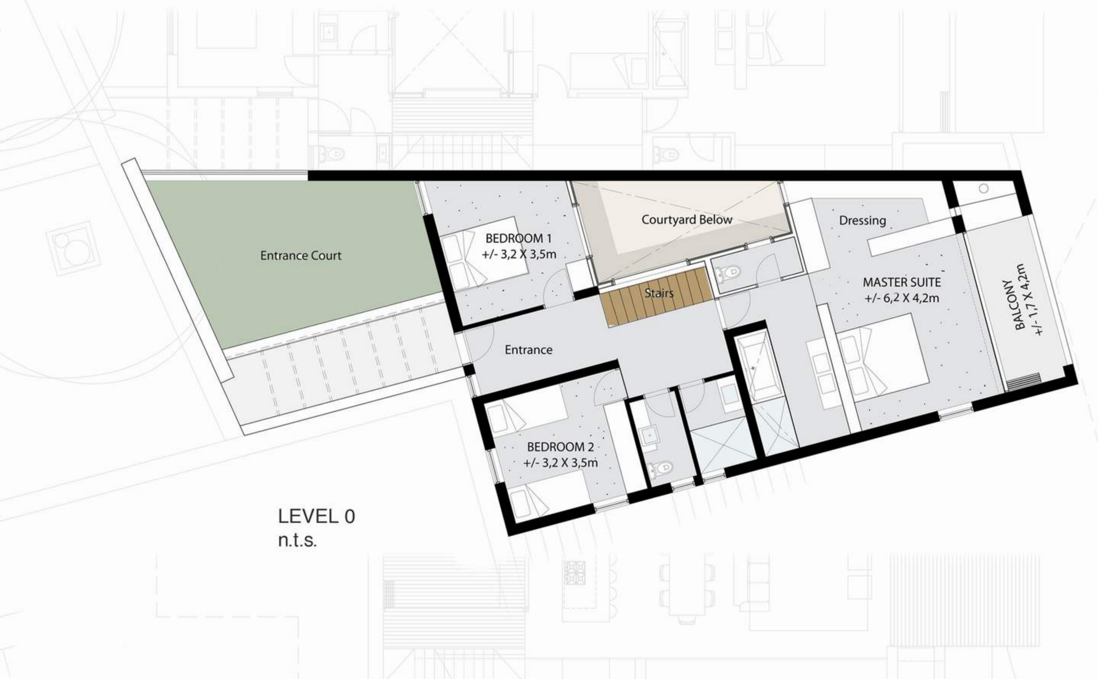
LEVEL 0 n.t.s.